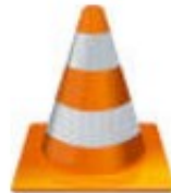
VLC media player